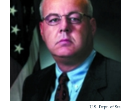
Ambassador J. Cofer Black Coordinator for Counterterrorism, Department of State

The Saudis have also widely publicized the names of twentysix terrorists. The last time I was in the kingdom, I took up a newspaper, opened it up, you have the names, you have the pictures, the Saudi citizens asked to provide any infor-