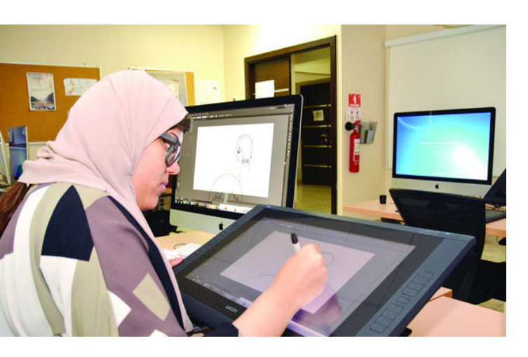
Effat University Student Pursuing a Degree in Filmmaking.